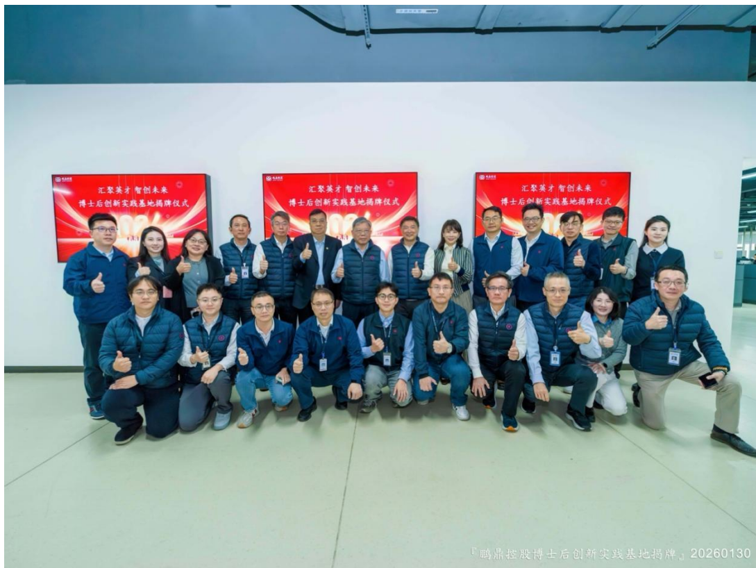
▲ The establishment of the Postdoctoral Innovation Practice Base underscores Zhen Ding's commitment to attracting top talent and investing in their development, as it builds a world-